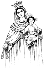
Our Lady of Mount Carmel